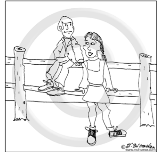
"Nah, I don't want to play house. Let's go condo instead."